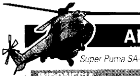
Super Puma SA-330